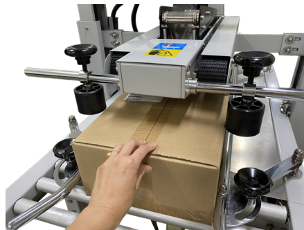
Quickly & Easily Adjust for Box Widths