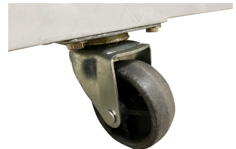
Casters for Flexibility